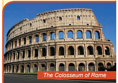
The Colosseum of Rome